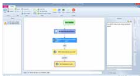
The Teneo Studio interface is clean and user friendly, with familiar icons guiding the user.

Teneo Studio is also putting power back into the hands of the users who need it most. Enterprise-ready, Teneo Studio allows large or disparate teams to collaborate, simultaneously building and managing any number of implementations across the online, mobile and connected consumer device channels.